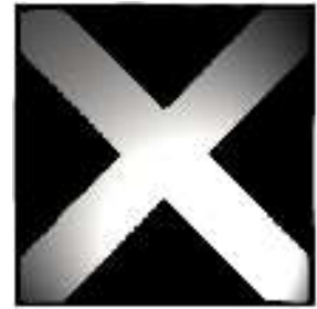
BADGE OF THE SALTERS' GUILD

An apprenticeship regularly lasts for four years. Depending on the kind of the master's business, the apprentice will work in the household in the workshop and/or the market booth, assisting in whatever the master of a senior journeyman tells him/her. Thus s/he learns the arts of the craft.