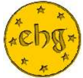
The European Hârnmaster Guild

If you have any kind of comments, please send an email to: xris@xris.de